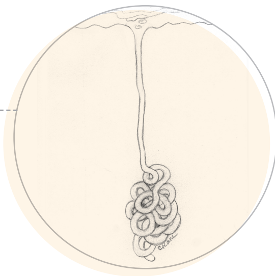
fig 2. Illustrated close up of eccrine sweat gland with acrosyringium duct

Detox Cleansing Deodorant™ may start to work after one application. Many factors contribute to the cleansing process. It may require additional time for your body to eliminate trapped impurities. For best results, we recommend Detox Cleansing Deodorant™ for nighttime use and Tropical Cove Deodorant or No Added Fragrance Deodorant for daytime use. We do not recommend applying any other products with the Detox Cleansing Deodorant such as: powders, lotions, perfumes, oils or other commercial deodorants or antiperspirants.